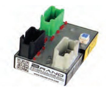
Radio Receiver, Radio Receiver,